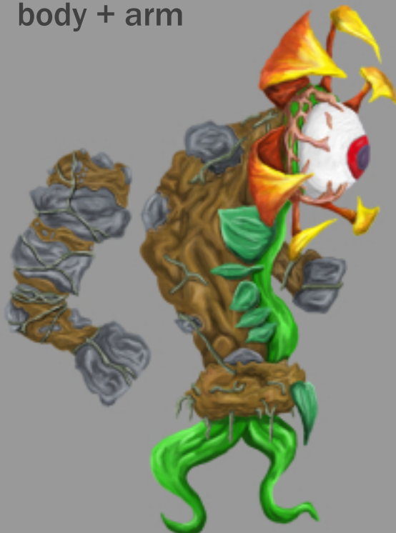
Final in-game asset.